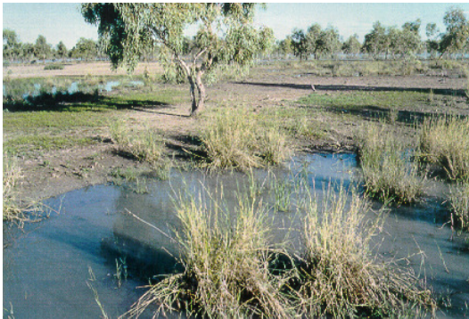
Habitat of the painted snipe at Tarrabool Lake on the Barkly Tablelands.

Australian painted snipe occur in shallow, vegetated, freshwater swamps, claypans or inundated grassland (including temporary wetlands). They feed at the water's edge and on mudflats, taking seeds and probing for invertebrates. Three to six eggs are laid in a shallow scrape nest. No sites are known where the species is resident and the species may well be nomadic. Its occurrence appears to be unpredictable (Rogers 2001). It is unobtrusive during the day, feeding primarily at night.